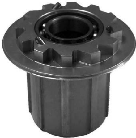
12 Tooth 3-Pin Style - 15mm Cassette Body

American Classic older 15mm 3-Pin style hub explained, conversions may not be possible