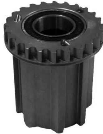
24 Tooth 3-Pin Style - 15mm Cassette Body

NOTICE: The cassette body uses a large black donut seal to protect the pawls.